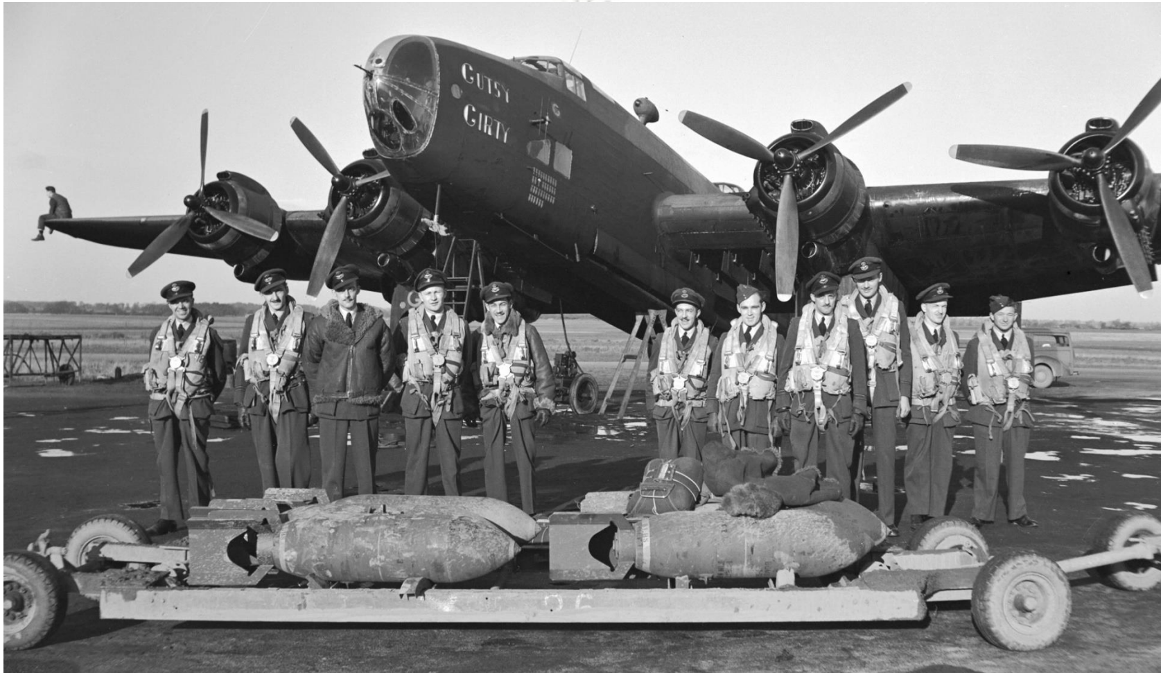
Handley Page Halifax B Mk. III bomber, nicknamed "Gutsy Girty", from No. 427 Squadron, shown at Leeming, Yorkshire, with its crew before a night operation.